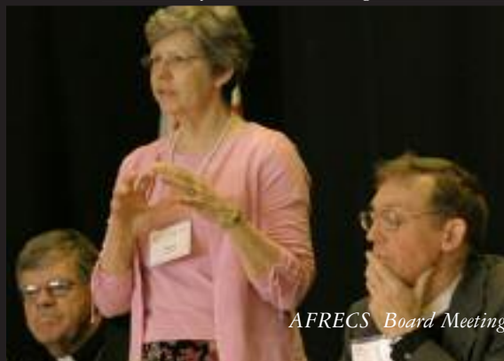
AFRECS Board Meeting