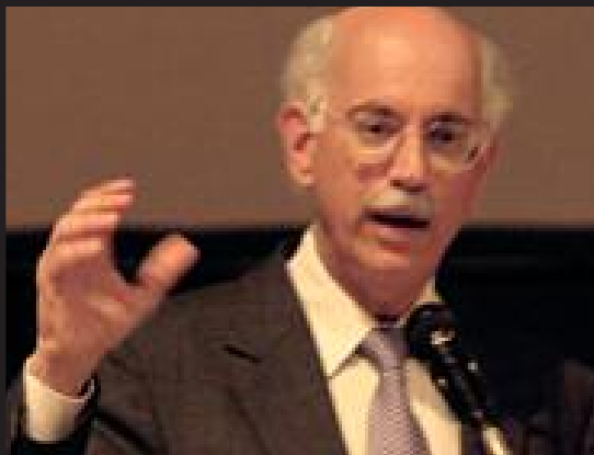
Andrew Natsios, US Special Envoy to Sudan