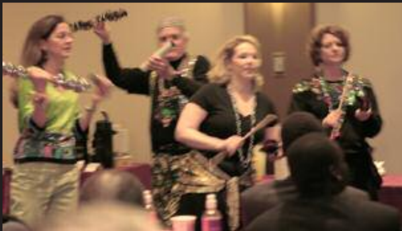
Drumming and dancing entertainment