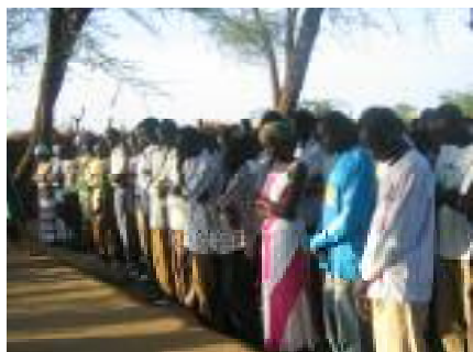
Kakuma: Students being prayed over prior to their qualifying exams.