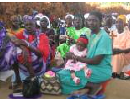
Women at church, Kakuma

It is impossible to separate the needs and plans of the Episcopal Church in Sudan from those of Sudanese civil