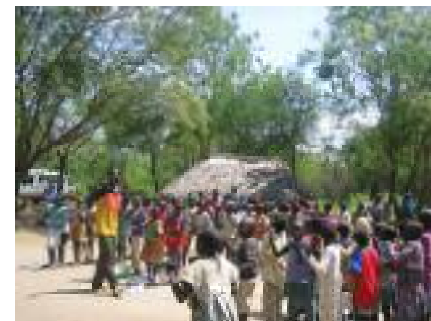
Malek bush school.

On one trip to Malek an armed escort was needed. There is a UN presence in Bor Town with SPLA and local security forces patrolling the streets; one of our traveling team was detained when he became suspect for taking pictures.